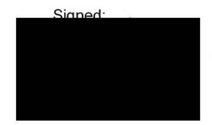
A person authorised to act in that behalf

For and on behalf of the Health and Safety Executive