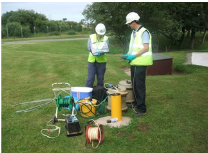
Groundwater Monitoring at Chapelcross

Under the Unified Arrangements for Regulatory Compliance in Projects During Defueling and/or Decommissioning (See Appendix B) Chapelcross ensures that decommissioning activities are carried out in accordance with the Environmental Management Plan. All changes to the system are assessed, during the proposal stage, against the requirements of the Environmental Management Plan and, where appropriate, mitigation measures are put in place to prevent impacts identified. This is a part of the integrated management system on site that is certified against ISO 9001, ISO 14001 and ISO 45001. In addition, where there is the potential for an activity to produce significant discharges or disposals, either radioactive or non-radioactive, the site undertakes appropriate optioneering studies (Best Practicable Means).