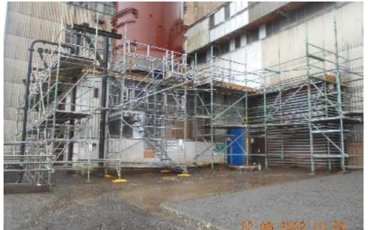
Reactor Roof and Handrail Project

During the Reactor Roof and Handrail project, nesting birds were identified on multiple occasions. Project team members were aware of the appropriate actions to take to ensure environmental protection of nesting birds allowing work to continue with suitable mitigations in place. This work demonstrated the proactive culture within the project team and site to consider environmental protection and performance continually.