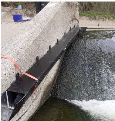
Eel Pass over Milnby Weir

Chapelcross site and Scottish Water hold a licence issued under the Water Environment (Controlled Activities) (Scotland) Regulations 2011 (as amended) for the management of the Weir. Therefore, a joint project of work between Chapelcross site and Scottish Water has been completed to install a 'Eel Pass' at Milnby Weir, to allow upstream migration of Eels and Lamprey and improve the ecological condition of the River Annan and associated waters. It should be noted that Chapelcross site licence for activities associated to Milnby Weir does not confer ownership.