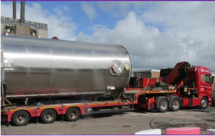
Chapelcross Modular Active Effluent Treatment Plant

The installation of a new Modular Active Effluent Treatment Plant has successfully been installed at Chapelcross site. This plant will support future decommissioning work at the site.