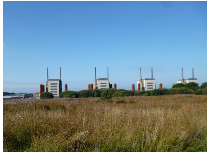
Vegetation surrounding Chapelcross