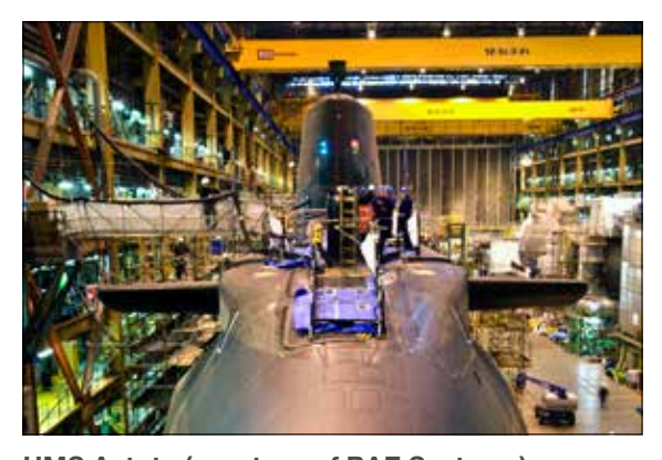
HMS Astute