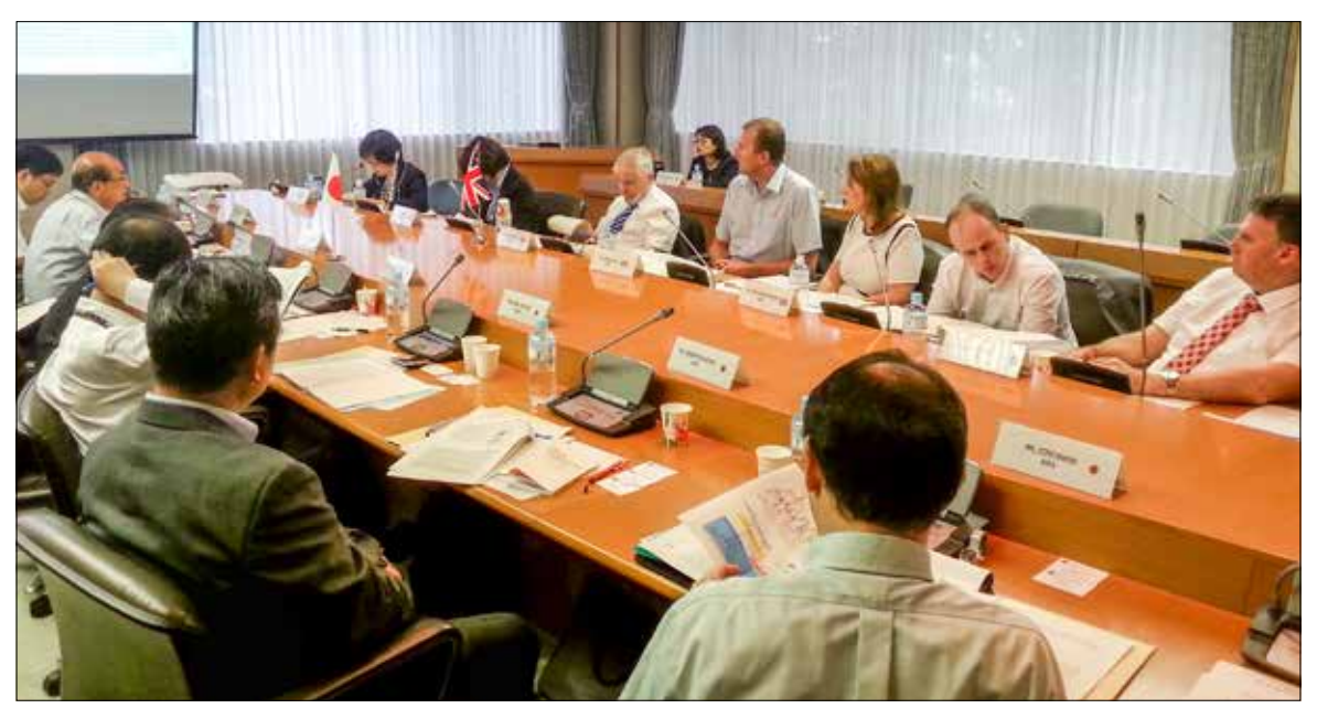
ONR meeting with Hitachi-GE, the British Embassy and the Nuclear Regulatory Authority (NRA), Japan's nuclear safety regulatory body.

The UK is also signatory to two international safety conventions; the Convention on Nuclear Safety and the Joint Convention on the Safety of Spent Fuel Management and the Safety of Radioactive Waste Management. ONR ensures that its practices align with the requirements of the conventions and takes part, every 3 years, in international peer review of the UK and other contracting parties' compliance with these Conventions. With respect to nuclear security the UK is signatory to the Convention on the Physical Protection of Nuclear Material.