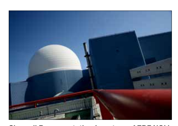
Sizewell B power station

Between them, the UK's nuclear power stations produce about 18% of the country's electricity.