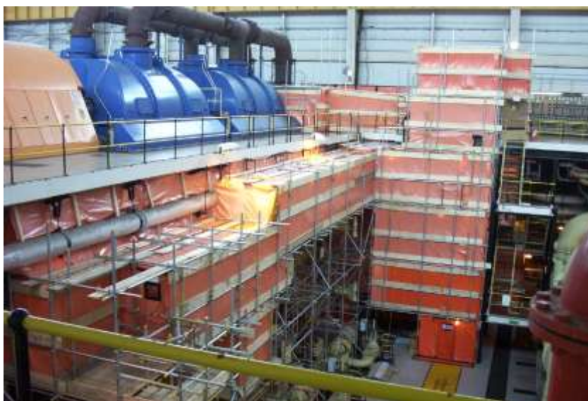
Photograph 3 Turbine Hall Asbestos Removal at Hinkley Point A Power Station

Non-radioactive asbestos will be double bagged in its wet state after stripping, hence there will be no liquid waste to be processed from the removal operation itself. Non-radioactive asbestos will be sent to off-site licensed asbestos disposal sites. Radioactive asbestos, which will be LLW, will be sent to a super-compaction facility, with the waste water produced by this process being filtered to remove any asbestos fibres before the compacted asbestos is sent to the LLW repository near Drigg. Radioactive asbestos which can be characterised as very low level radioactive waste (VLLW) can be disposed of to alternate suitably licensed disposal facilities.